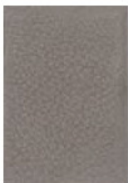
Grigio Topo 1683