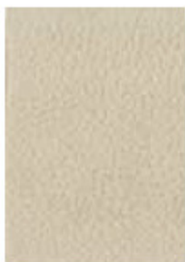
Bianco Crema 1681